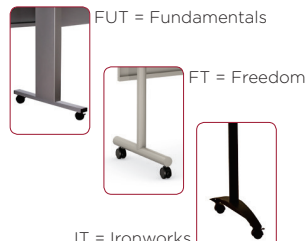
Table Leg Options