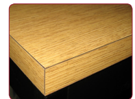
-SE = self-edge

tables available in all standard edge treatments