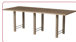
rectangular shaped table HET10848-PV