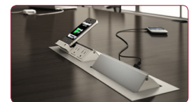
tables may be powered and are available with electrical popups