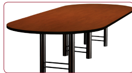
race track shaped table HETR12042-PV