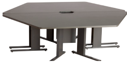
available with or without adjustable height tech station