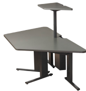
3 person workstation