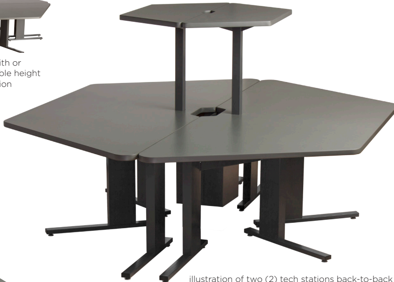
illustration of two (2) tech stations back-to-back