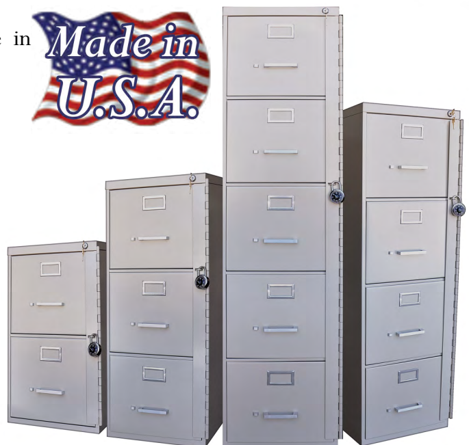
HSB Style Front On Left | HSA Style Front On Right

Security Lock Bars may be added for additional security.