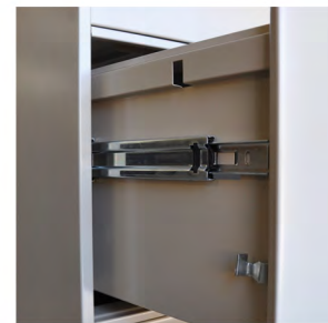
Steel Ball Bearing Suspension