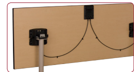
may be ordered flip/nest table ex: ARTMN7224NTT-PV