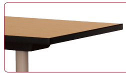
1-1/4" laminate top, M3 commercial grade wood core (45#-48# density)

optional short modesty panel reinforced w/heavy duty gussets for strength