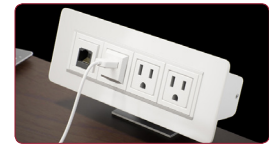
tables may be powered and are available with electrical popups