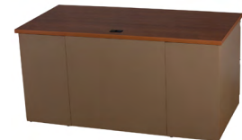
ESCUD6030FBF-PV backside - full back panel

ESCUDM6030FBP-PV single ped mobile or glides