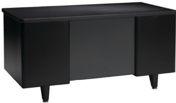
M-Line with Steel Top