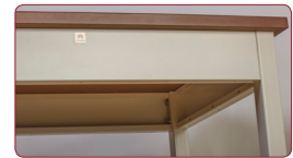
rugged heavy duty construction