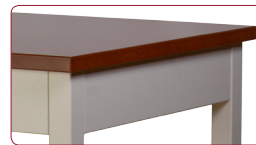
1-1/4" laminate top, M3 commercial grade wood core (45#-48# density)