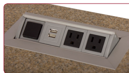
laminate tables may be powered and are available with electrical popups