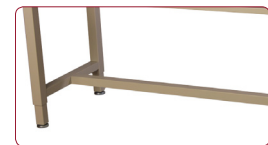
optional lower stretcher rail spanner