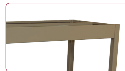
optional top center stretcher rail spanner