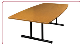
boat shaped table FTB8448NTT-PV