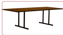
rectangular shaped table FT9642NTT-PV