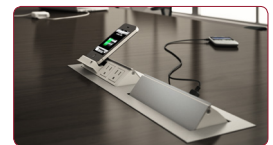
tables may be powered and are available with electrical popups

Reference "Styles" add "B" after FT for boat shaped top Add "R" after FT for race track shaped top