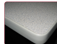
-TE = T-Mold