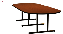
race track shaped table FTR12042NTT-PV