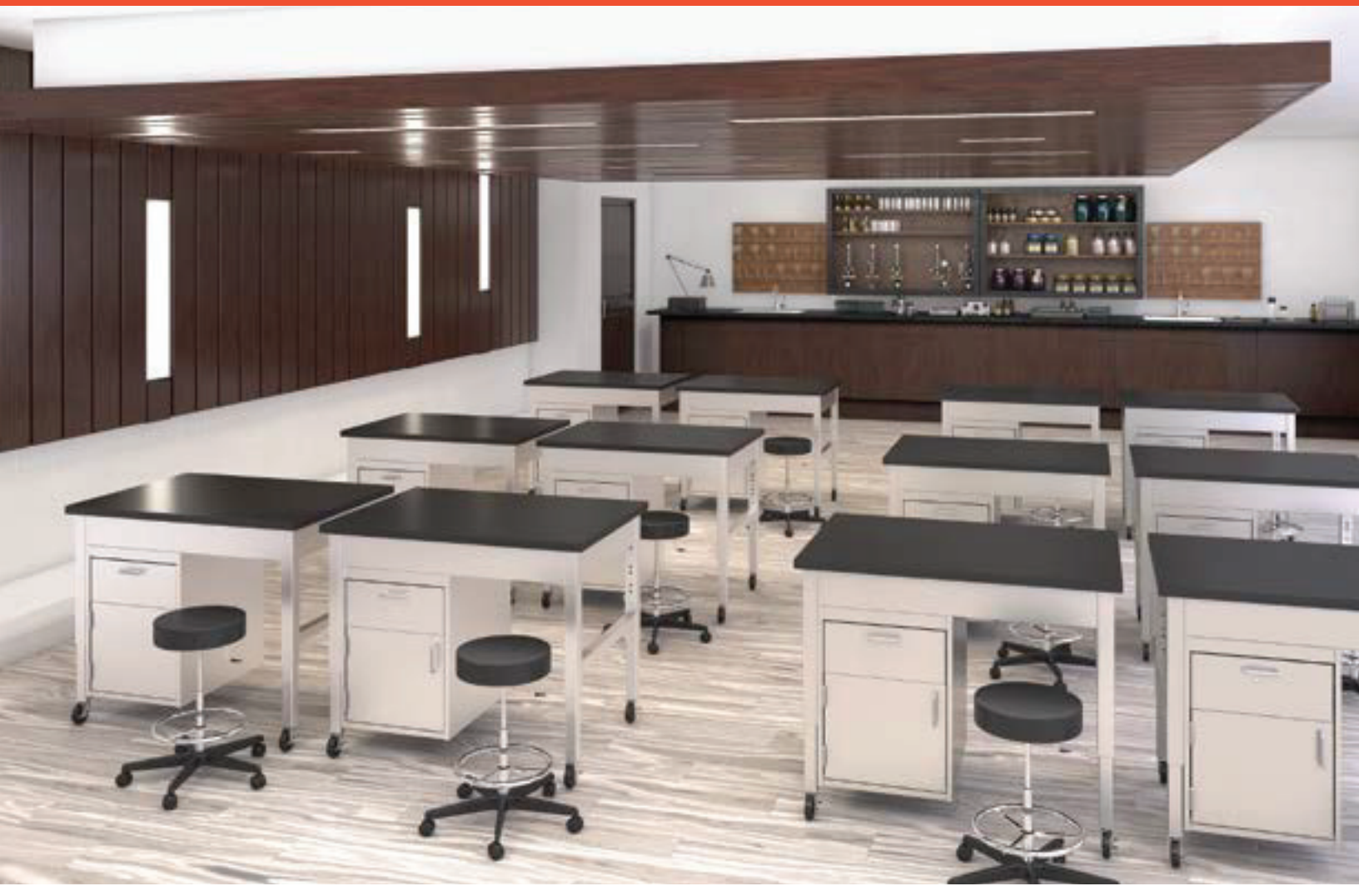
Maxum can also be configured as a Lab table with top options such as Chemsurf, Phenolic Resin or Epoxy Resin.