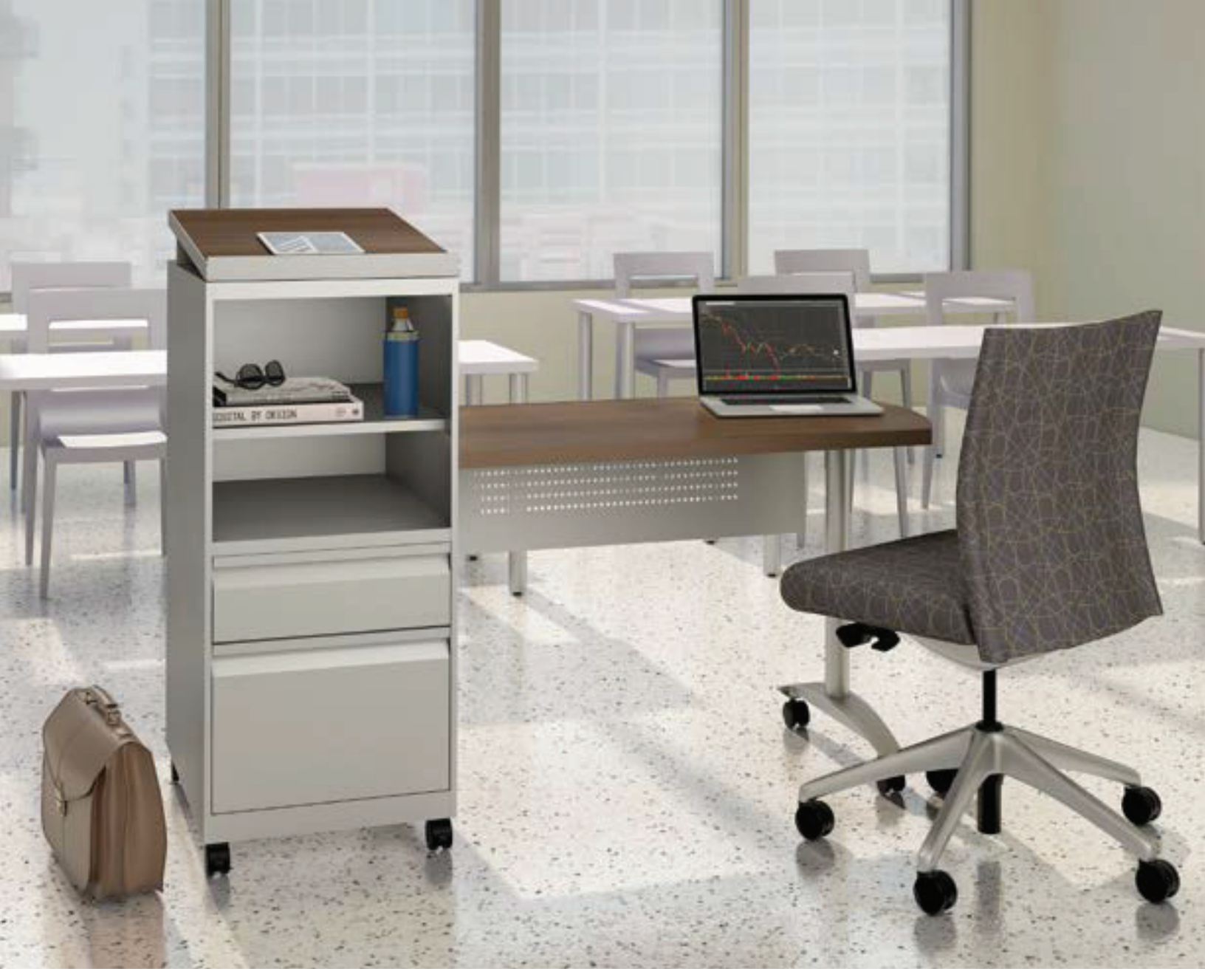
SHOWN: Educator Series Podium / Lectern Desks!