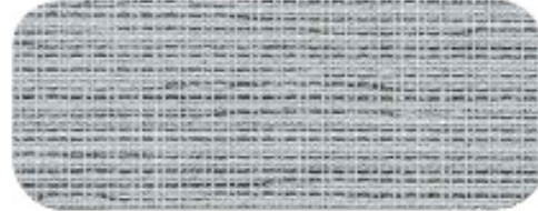
TEMPEST 2120 031 Frost