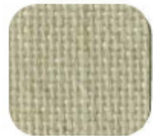
FR701@ 2100 755 Leaf