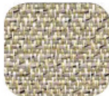
LIDO 2858 031 Smith Point