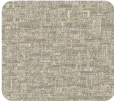
AUSTER 2537 030 Pebble