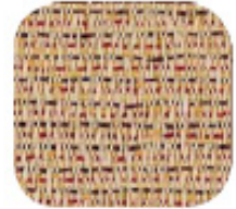
SPINEL 3582 113 Amber