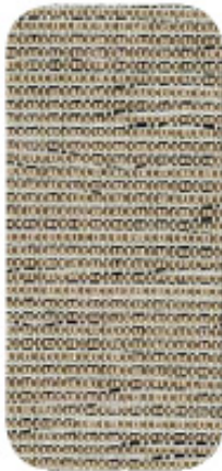
TEMPEST 2120 041 Gold Rush