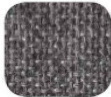
FR7018 2100 298 Medium Grey