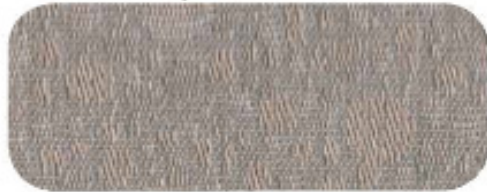
NITRO 2317 020 Spritzer