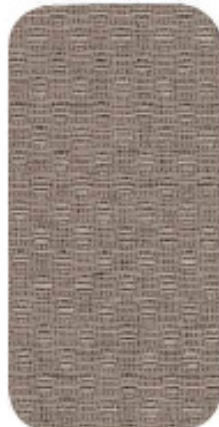
STREETWISE 2721 1893 Pigeon