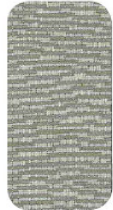
DRIFT 2539 011 Dusty Miller