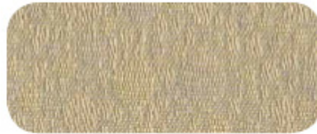
NITRO 2317 030 Lemon Lime