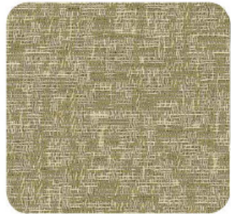
AUSTER 2537 021 Sprout