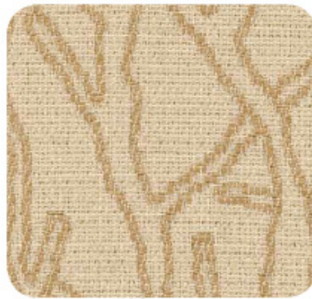
TIMBERLINE 3903 053 Sunspot