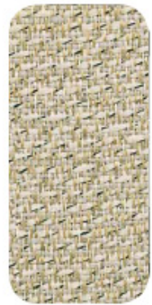
LIDO 2858 010 Hermosa