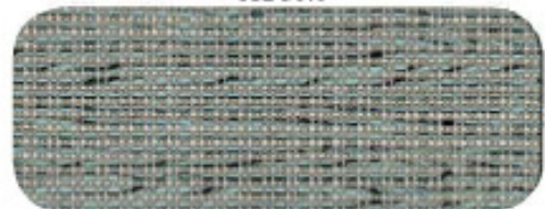
TEMPEST 2120 021 Undercurrent