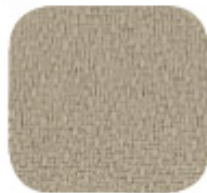
ANCHORAGE 2335 2035 Angora