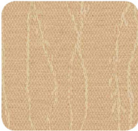
COASTLINE 3495 030 Sunset