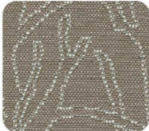
TIMBERLINE 3903 060 Poplar