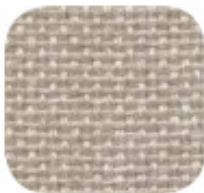
FR701@ 2100 758 Desert Sand