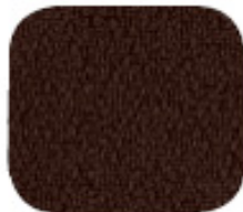
ANCHORAGE 2335 2083 Coffee Bean