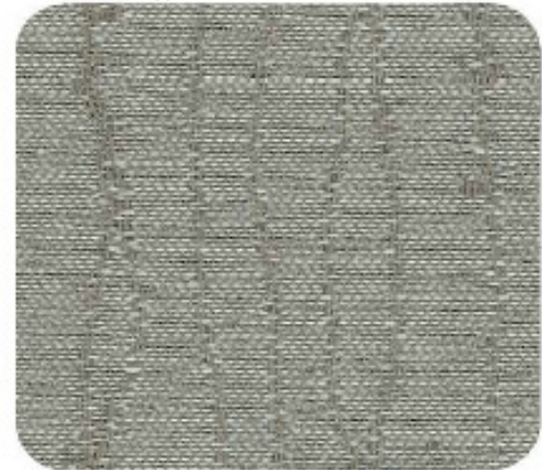
COASTLINE 3495 091 Dove