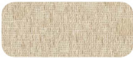
NITRO 2317 042 Cream Soda