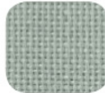
FR7018 2100 468 Eucalyptus