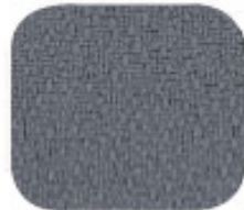
ANCHORAGE 2335 2027 Wolf