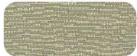
DRIFT 2539 030 Sprout