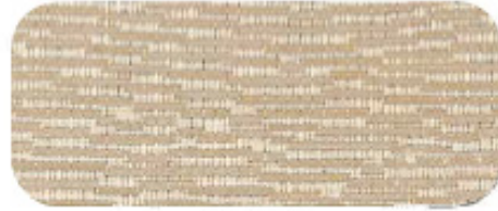
DRIFT 2539 020 Alabaster