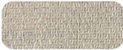
SPINEL 3582 011 Opal