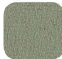
ANCHORAGE 2335 2047 Eucalyptus