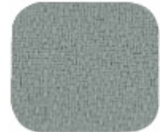
ANCHORAGE 2335 2017 Slate