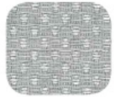
STREETWISE 2721 1894 News Stand