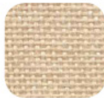
FR701@ 2100 748 Bone