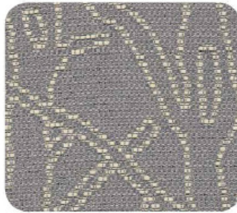
TIMBERLINE 3903 030 Woodberry